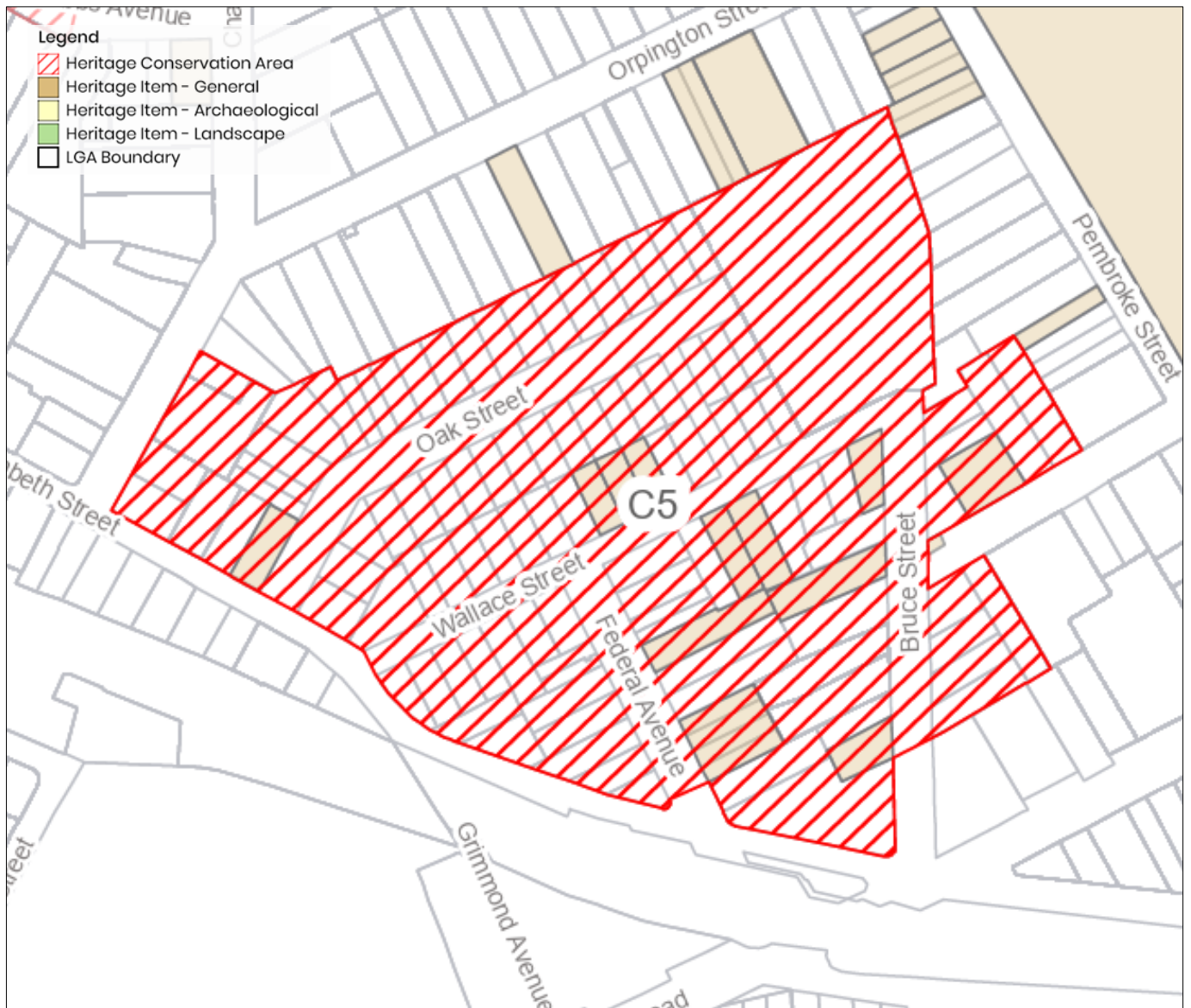
Figure 1. Federal Fyle Heritage Conservation Area Map