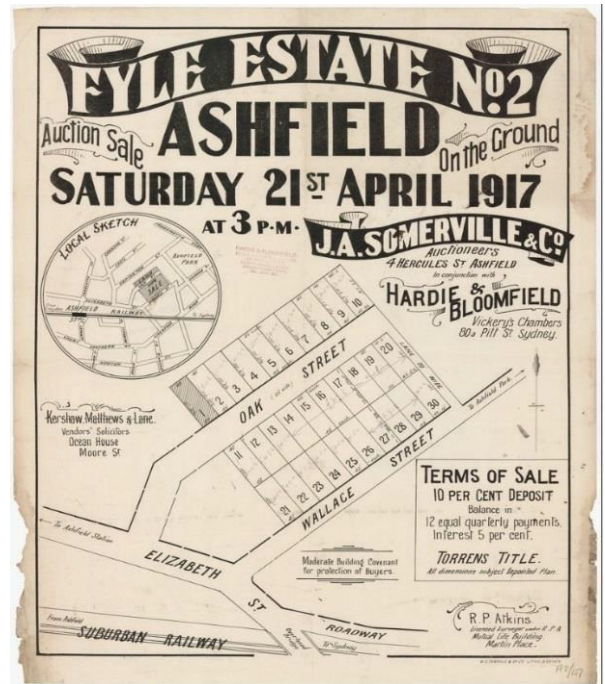
Above: Henson's Estate subdivision plan 5 September 1903.