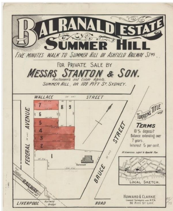
Above: Balranald Estate subdivision plan (undated).