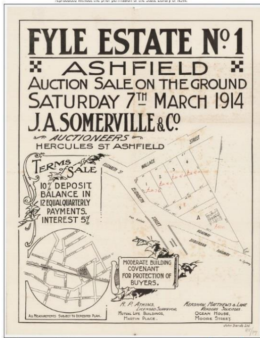
Above: Fyle Estate No. 1 subdivision plan 7 March 1914