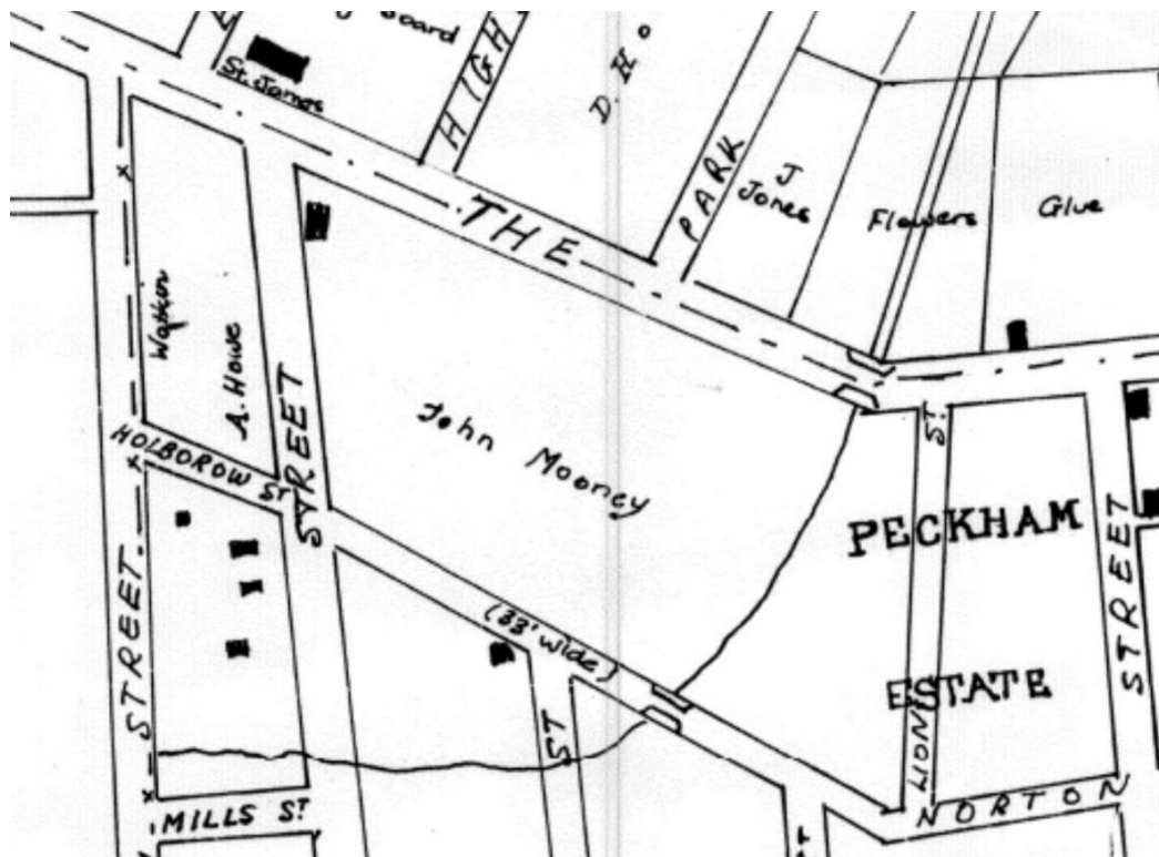
Above: Extract of 1883 Higginbotham & Robinson map of Ashfield showing Mooney and Howe's land south of Liverpool Road prior to subdivision, south of Liverpool Road and north of Norton Street. Howes and Watkin's land is bounded by Greenhills Street to the west and Holborow Street to the east.