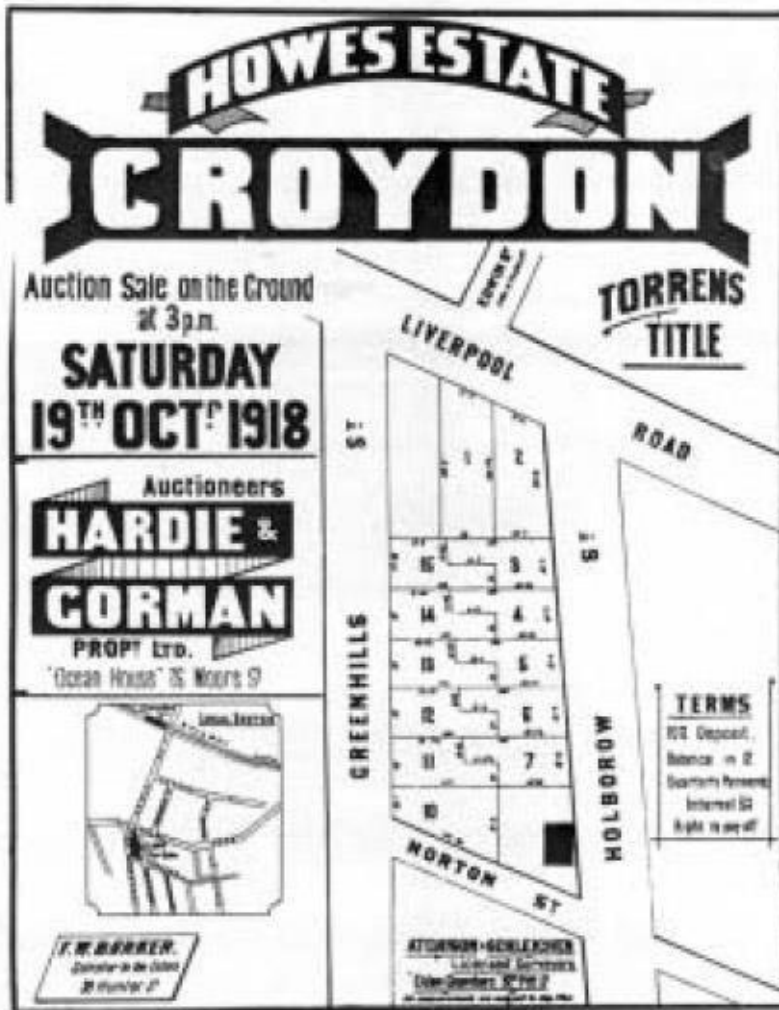
Above: The 1918 subdivision plan of Howes Estate (sic) from Hardie & Gorman's journal in which the auction sale was announced. Note the site of Nos. 19-21 Holborow Street is shown in the 1918 plan as already having a building on it. This building, a pair of Federation period semi-detached 2-storey houses, remains, however has been altered and extended.