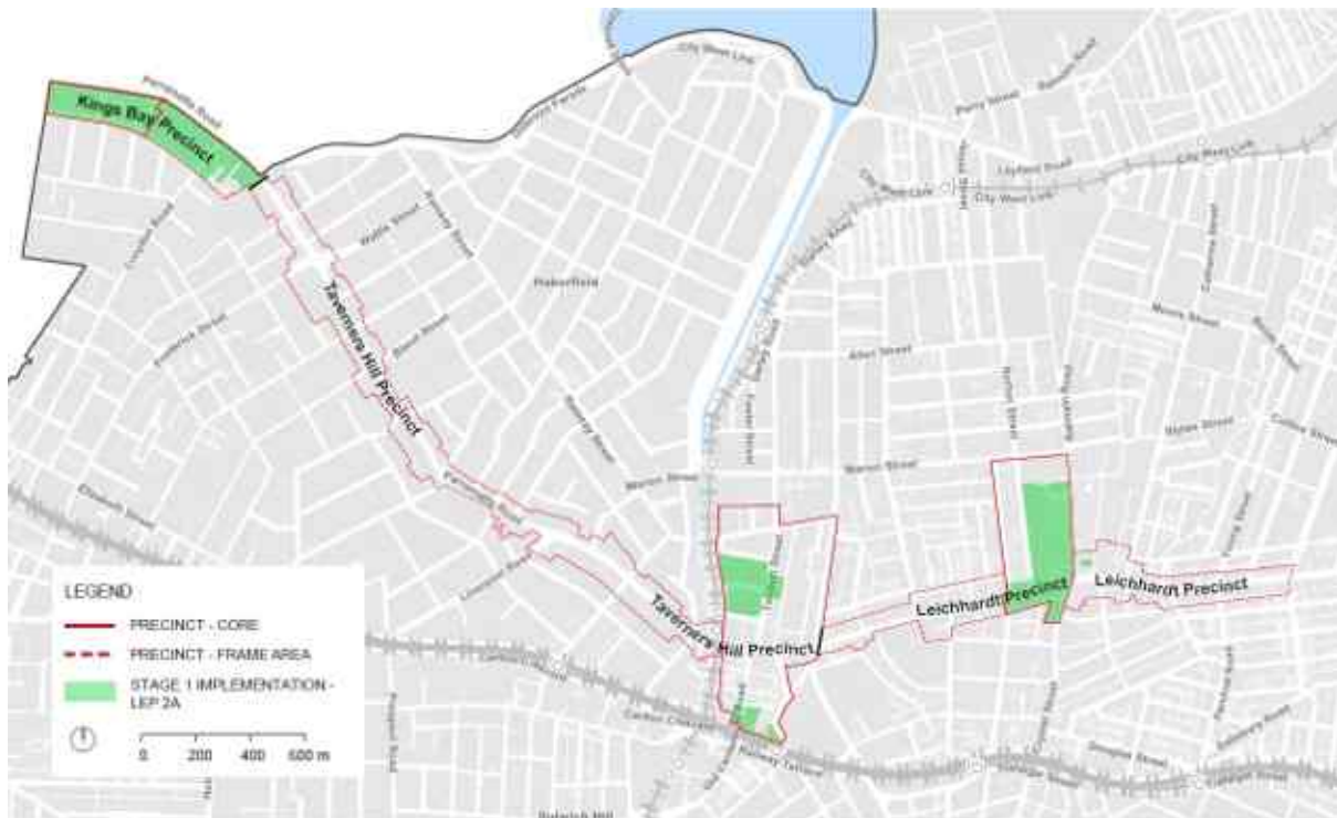
Figure 1 – Map showing the land within Stage 1 of PRCUTS Implementation

Figure 1 shows the extent of the PRCUTS precincts of Leichhardt, Taverners Hill, Kings Bay affected by this IWLEP amendment (Stage 1- Phase 2A Implementation Area).