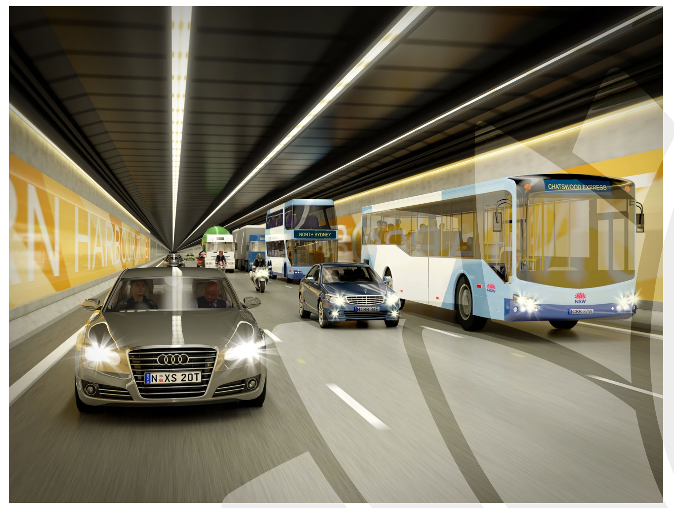
Artsist's impression, Western Harbour Tunnel.

1 This figure is a combination of petrol powered vehicles (0.8%), light duty (2.2%) and heavy diesel (5.3%) vehicles and non-exhaust vehicles such as brake and tyre wear (5.5%)