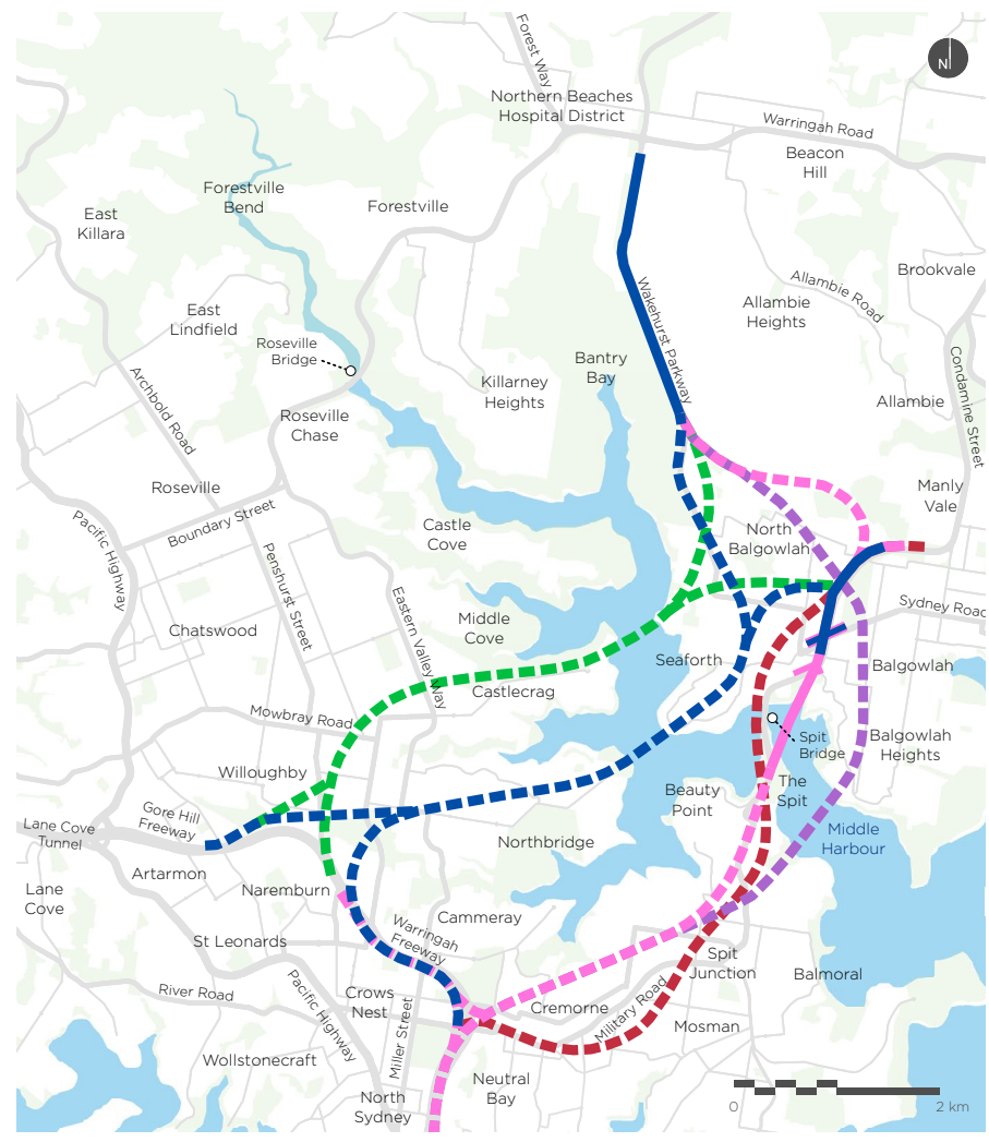
Indicative map of options assessed

A Middle Harbour crossing between Sugarloaf Point and Pickering Point meant the tunnels would have steep gradients, leading to poor traffic performance and increased ventilation requirements.