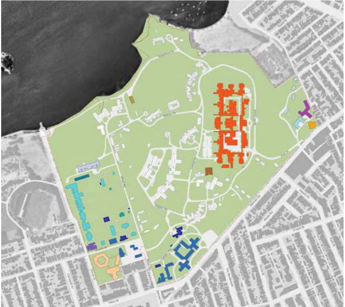
Figure 1-2 Site Plan. The buildings indicated in colour are presently occupied by tenants

There are a number of tenants occupying buildings across the site, which include: