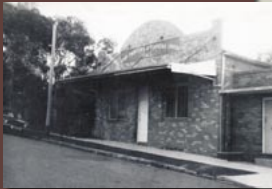
4.Ship Painters and Dockers Hall

Leichhardt Council acknowledges the traditional owners of this land - the Gadigal and Wangal people, who form part of the Dharug nation (commonly referred to today as Eora) and their descendants.