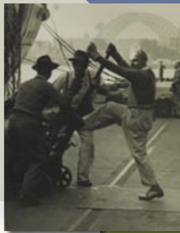
3.Issy Wyner Reserve