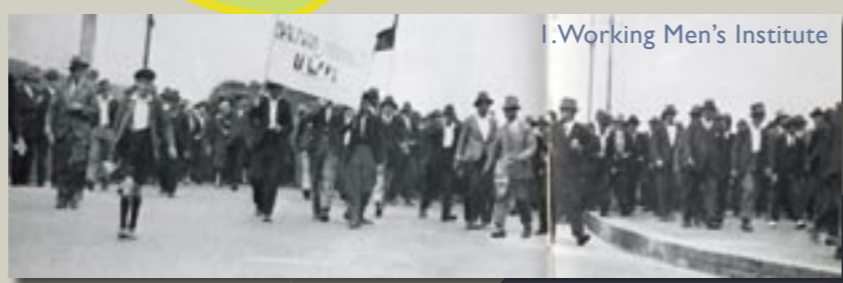
1.Working Men's Institute