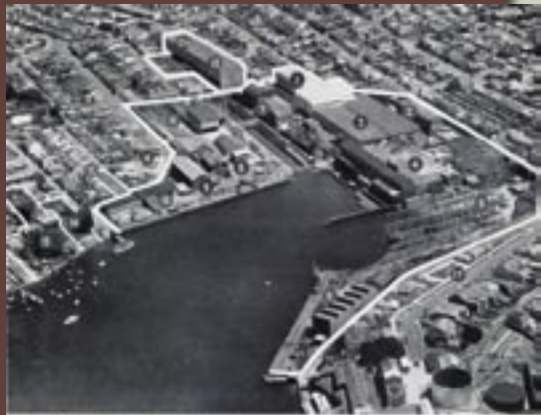
5.Mort Bay Park/ Mort's Dock/ Ballast Point