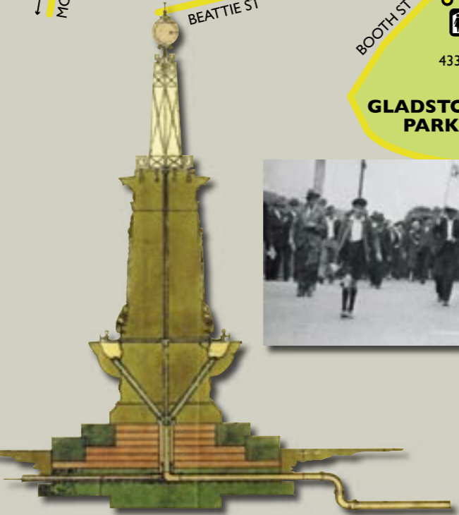
2.Unity Hall Hotel/ Loyalty Square War Memorial