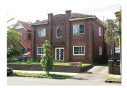
Inter War Art Deco - lace brick