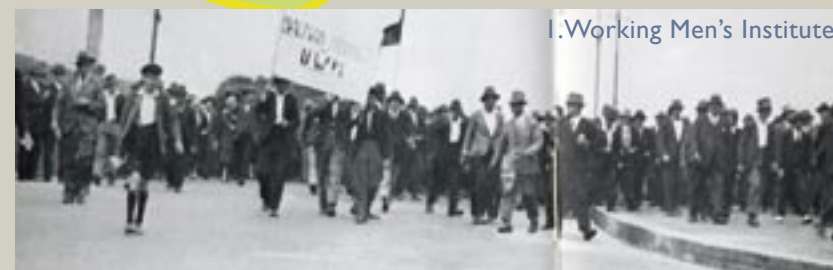
1.Working Men's Institute