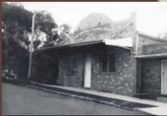
4.Ship Painters and Dockers Hall

Leichhardt Council acknowledges the traditional owners of this land - the Gadigal and Wangal people, who form part of the Dharug nation (commonly referred to today as Eora) and their descendants.