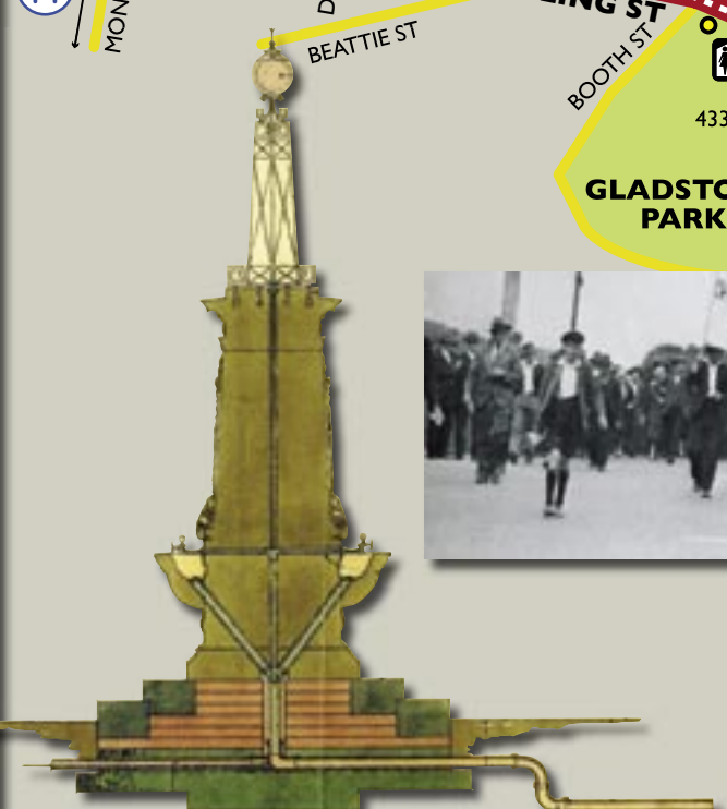
2.Unity Hall Hotel/ Loyalty Square War Memorial