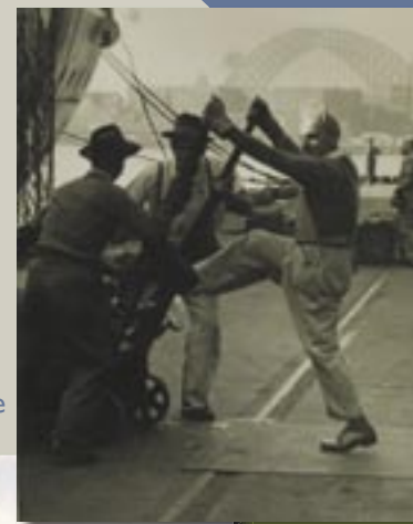
3.Issy Wyner Reserve