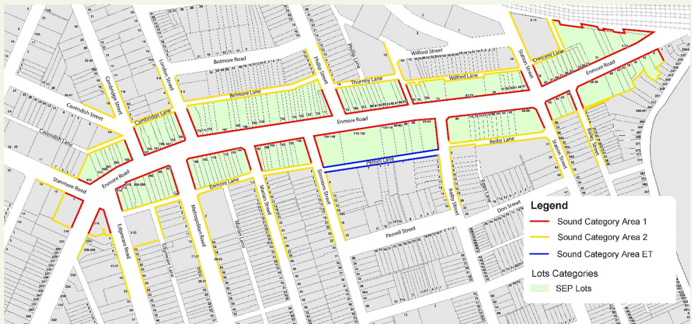
Figure 2.26.1 – Enmore Road Sound Category Area map

Section 2.26 applies to land identified as a Sound Category Area in the following maps: