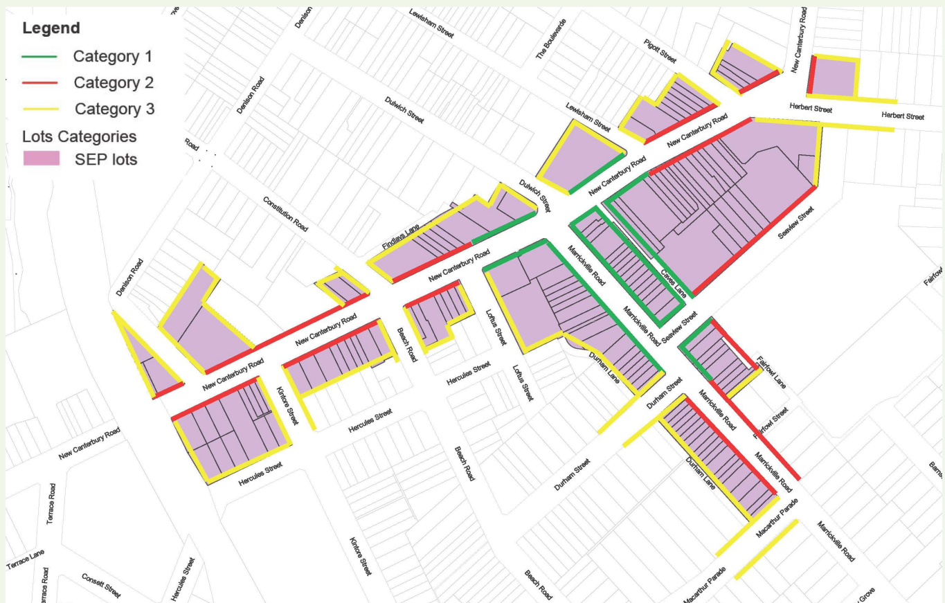
Figure 2.26.2 – Dulwich Hill Sound Category Area map