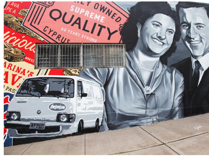
The Spirit of St Peters by Alex Lehours