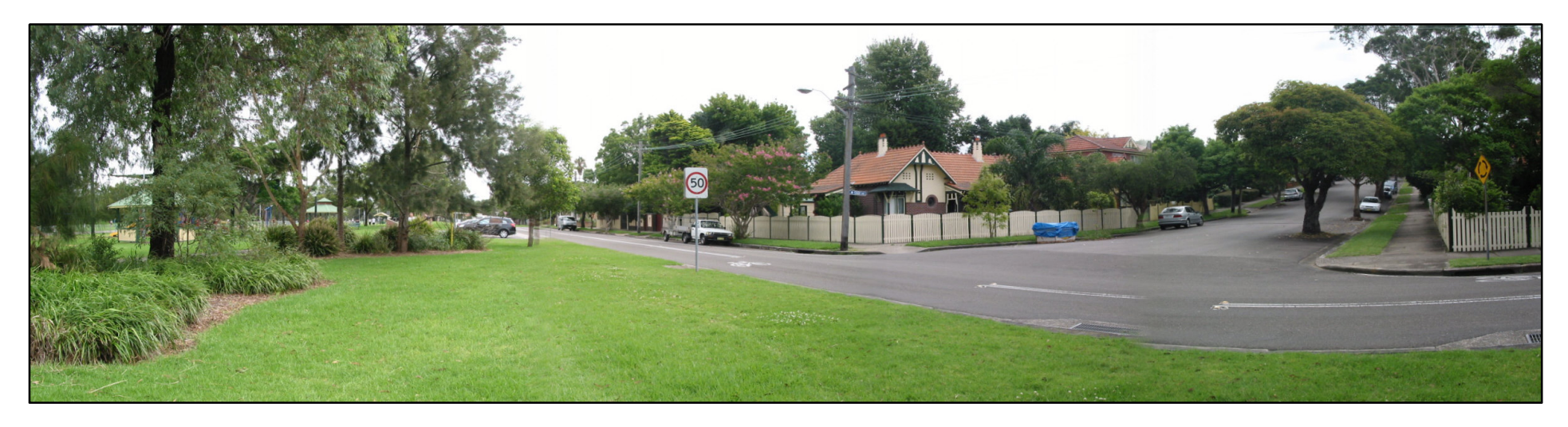
Figure 5-9: Hawthome Parade and Barton Ave