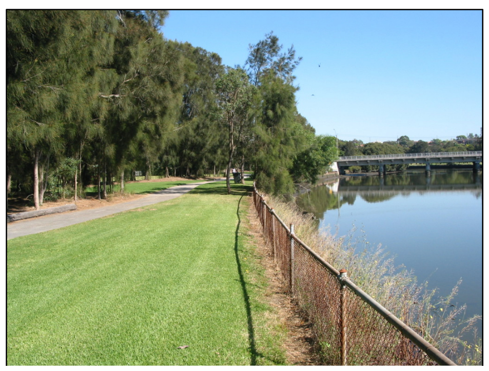
Figure 5-11: Cooks River at Beaman Park

Within an urban environment there is likely to be areas that are more 'natural' and akin to a more, broad-stroke, design response. Riparian areas are a prime example of locations where restoration projects can provide sound ecological outcomes through basic maintenance and planting strategies as well as significant reconstruction and rehabilitation as exists, and is proposed by the Sydney Catchment Authority for large sections of the Cook's River foreshore.