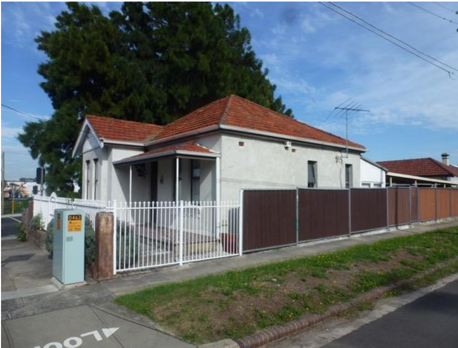
Image 4: 149 Unwins Bridge Road, Tempe, following rendering, March 2017

Following the 28 February 2017 Council Meeting, the property owner engaged a heritage consultant to undertake an assessment of the property and requested that the submission period be extended to 17 April 2017. Council officers agreed to this request. On Monday 13 March, Council received notification from the Marrickville Heritage Society that the front façade and side wall to Unwins Bridge Road had been rendered without Development Consent. Council's Heritage Advisor and Team Leader attended the site and took photographs of the changes which are included at ATTACHMENT 5 . Council's Monitoring Services section and General Counsel have been informed of the modifications and requested to take action as they deem appropriate.