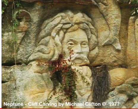
Neptune - Cliff Carving by Michael Clifton © 1977

Follow the Public Art Map and discover a world of creativity at your doorstep. Public art makes a valuable contribution to an enlivened and vibrant locality, by complementing and building on the unique qualities of our streetscapes and town centres.