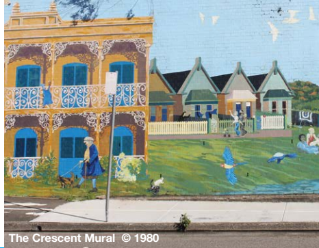
The Crescent Mural © 1980

Follow the Public Art Map and discover a world of creativity at your doorstep. Public art makes a valuable contribution to an enlivened and vibrant locality, by complementing and building on the unique qualities of our streetscapes and town centres.