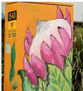
Angela Cranston © 2011