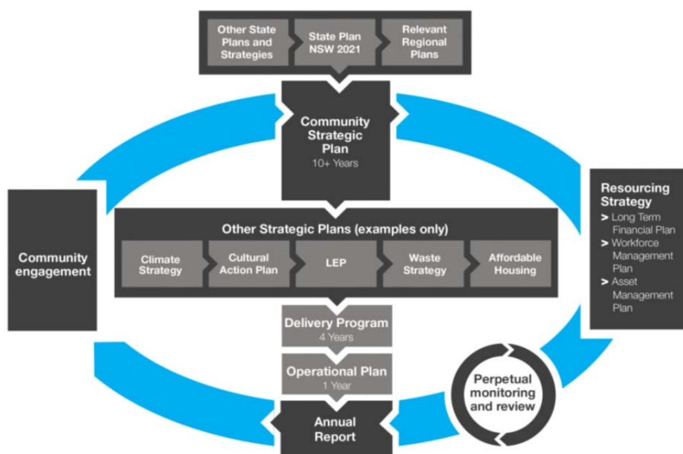
Figure 3: Integrated Planning and Reporting (IPR) framework

The IP&R requires the development and maintenance of a hierarchy of documents as shown in figure 3 including a Community Strategic plan which identifies community aspirations, a Resourcing Strategy which identifies the resources that will be needed to implement the Community Strategic Plan, a Delivery Program that documents principle activities and an Operational Plan that outlines specific details for each of the four years of the Delivery Program.