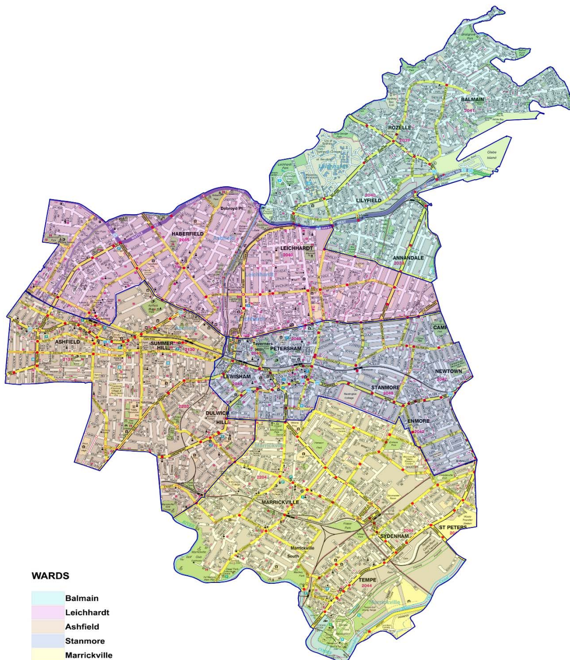
Figure 1 Inner West Council Wards

Figure 1 shows the shows the Inner West Council boundary area is comprised of 5 wards for ease of administration. The 5 Wards are Ashfield, Balmain, Leichhardt, Marrickville and Stanmore.