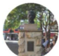
Mei Quong Tart Statue To be retained