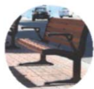
Bench seat with back