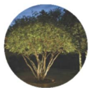
Feature up-lighting / spot lighting to trees