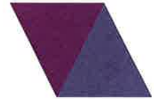
Table of Uses

The following guidance is provided in relation to particular land uses under the Commercial 3 Zone.