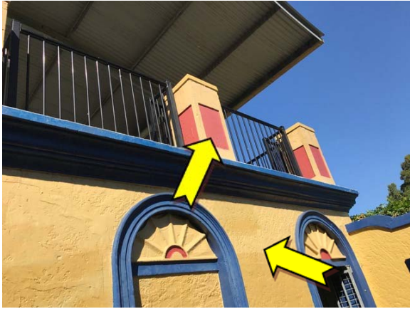
Photo 1. Exterior, ground level, wall - suspected lead-containing yellow and red upper paint systems.