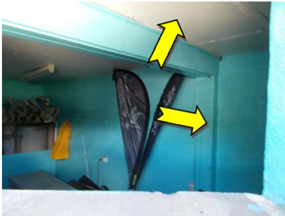
Photo 3. Interior, throughout, ceiling and walls – suspected lead-containing white and light blue upper paint systems.