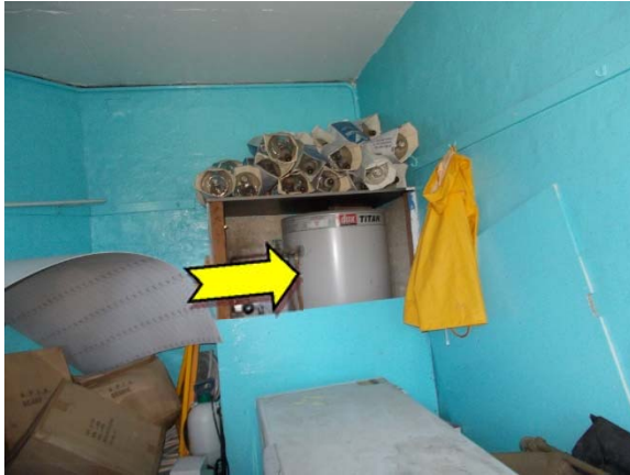
Photo 1. Interior, store room, hot water heater – suspected SMF internal insulation.