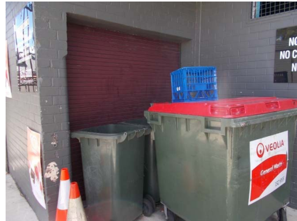
Photo 4. No access to garage at the time of Assessment.