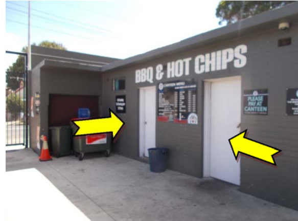
Photo 2. Exterior, throughout, walls and doors – suspected lead-containing grey and white upper coloured paint systems.