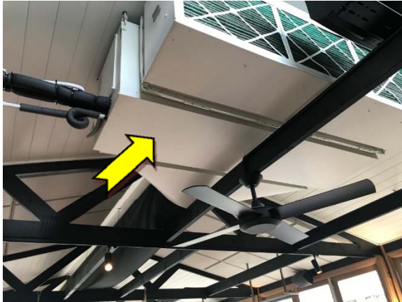
Photo 1. Interior, throughout, duct work – suspected SMF internal insulation.