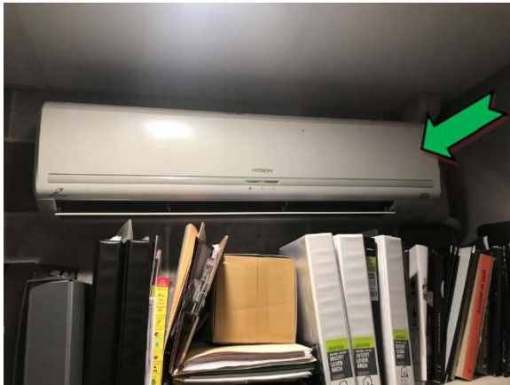
Photo 3. Interior, office, air conditioning unit, unknown refrigerant – suspected non ODS-containing refrigerant.