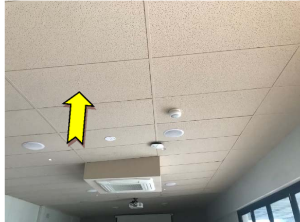
Photo 2. Interior, community room, ceiling – suspected SMF-containing compressed ceiling tiles.