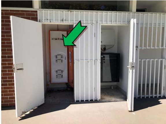
Photo Interior, electrical backing board – suspected 1. non asbestos-containing bituminous backing board.