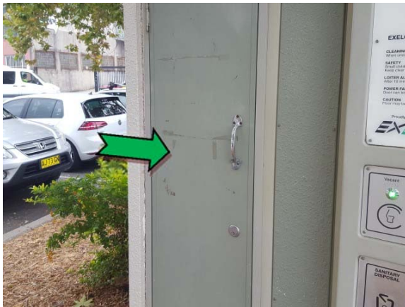
Photo 3. Exterior, throughout, doors – suspected non lead-containing green upper paint system.