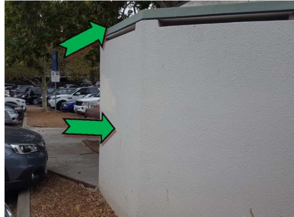
Photo 2. Exterior, throughout, walls and roof – suspected non lead-containing cream & green upper coloured paint systems.