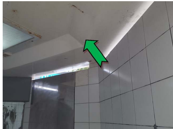
Photo 4. Interior, throughout, ceiling – suspected non lead-containing white upper paint system.