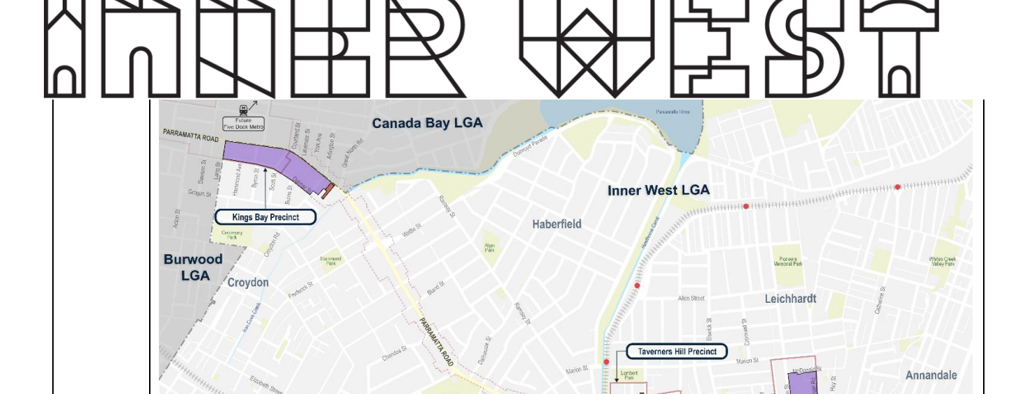
Figure 1 Parramatta Road Corridor Stage 1 Planning Proposal Area

The Planning Proposal and supporting DCP amendments will: