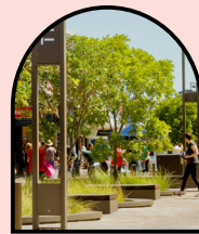
Making streets greener