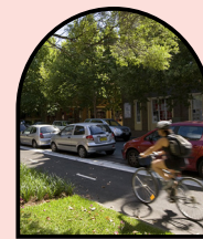
Improving walking and cycling