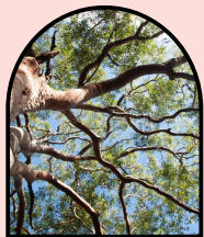
Connecting with country