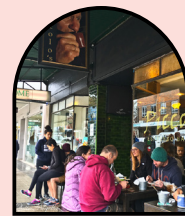
Supporting local business