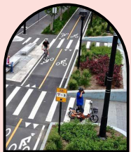
Bringing together both sides of Rozelle