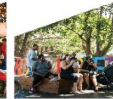
Architecture & history