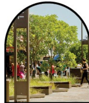
Making streets greener