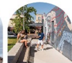
Seating & outdoor meeting