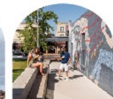
Seating & outdoor meeting