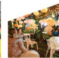
Entertainment & events