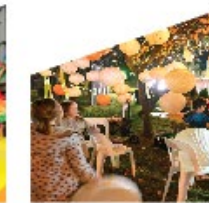
Entertainment & events