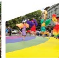
Public art & Street performances