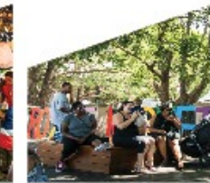
Architecture & history