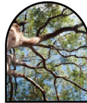
Connecting with country