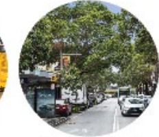
Availability of parking