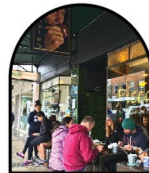
Supporting local business