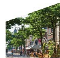
Trees & greenery