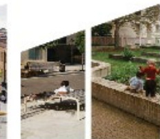
Places for Play