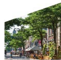
Trees & greenery