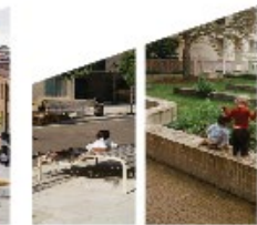
Places for Play