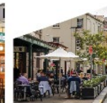
Food & retail options