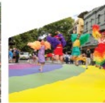
Public art & Street performances