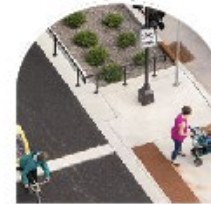
Accessibility & inclusion for people with disability