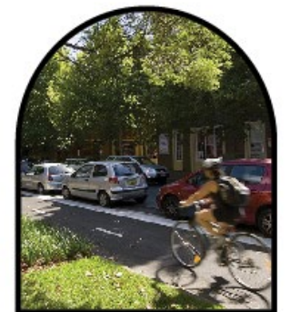
Improving walking and cycling