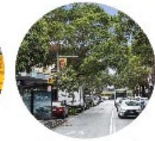
Availability of parking