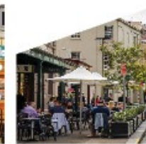
Food & retail options