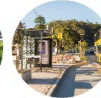
Access to public transport