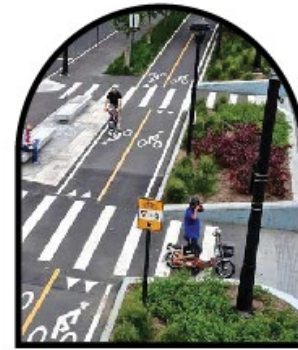
Bringing together both sides of Rozelle