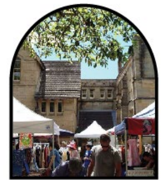
Celebrating diverse culture