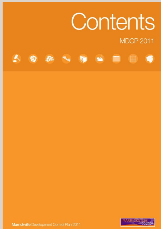
Marrickville DCP 2011