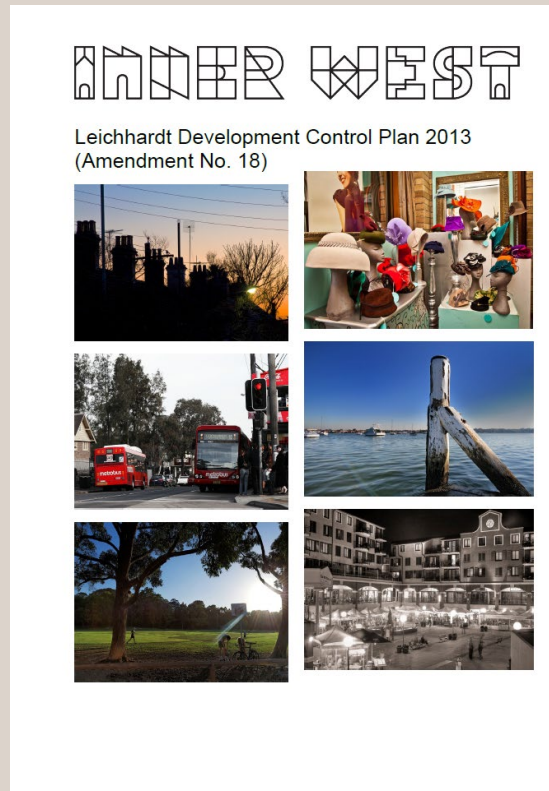
Leichhardt DCP 2013