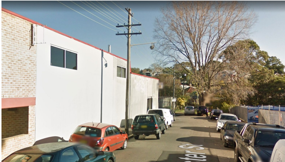
Image 3 - Existing building on the subject site indicating step down towards

In principle, the proponent's intention to retain the existing industrial character is supported, however, the proposed design scheme does not appropriately reflect the existing or desired character and therefore, should not be supported.