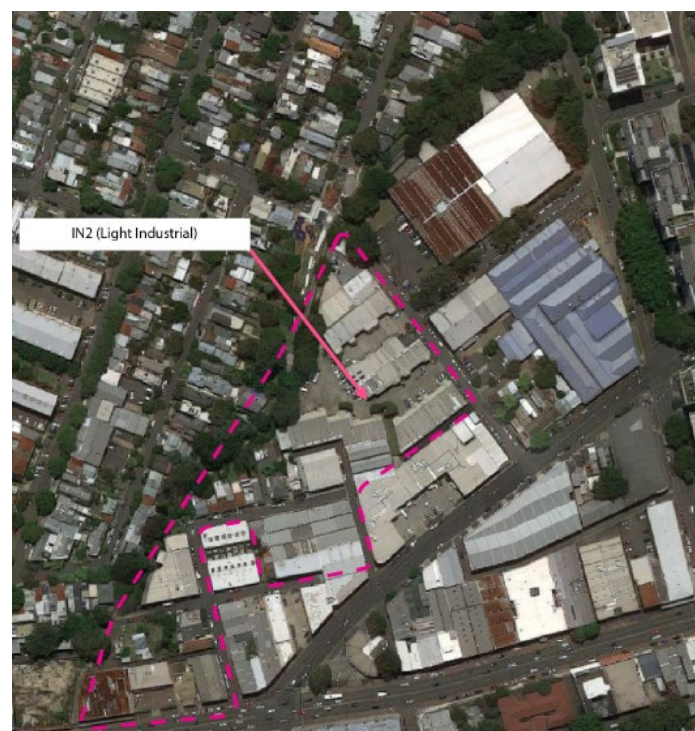
Figure 2 - Extract from Leichhardt's Industrial Precinct Planning Report 2016 which made recommendations for the redevelopment of Camperdown precinct including an option to reconfigure the rezoning of the Camperdown precinct to B5 Business Development with Light Industrial IN2 uses on the periphery.