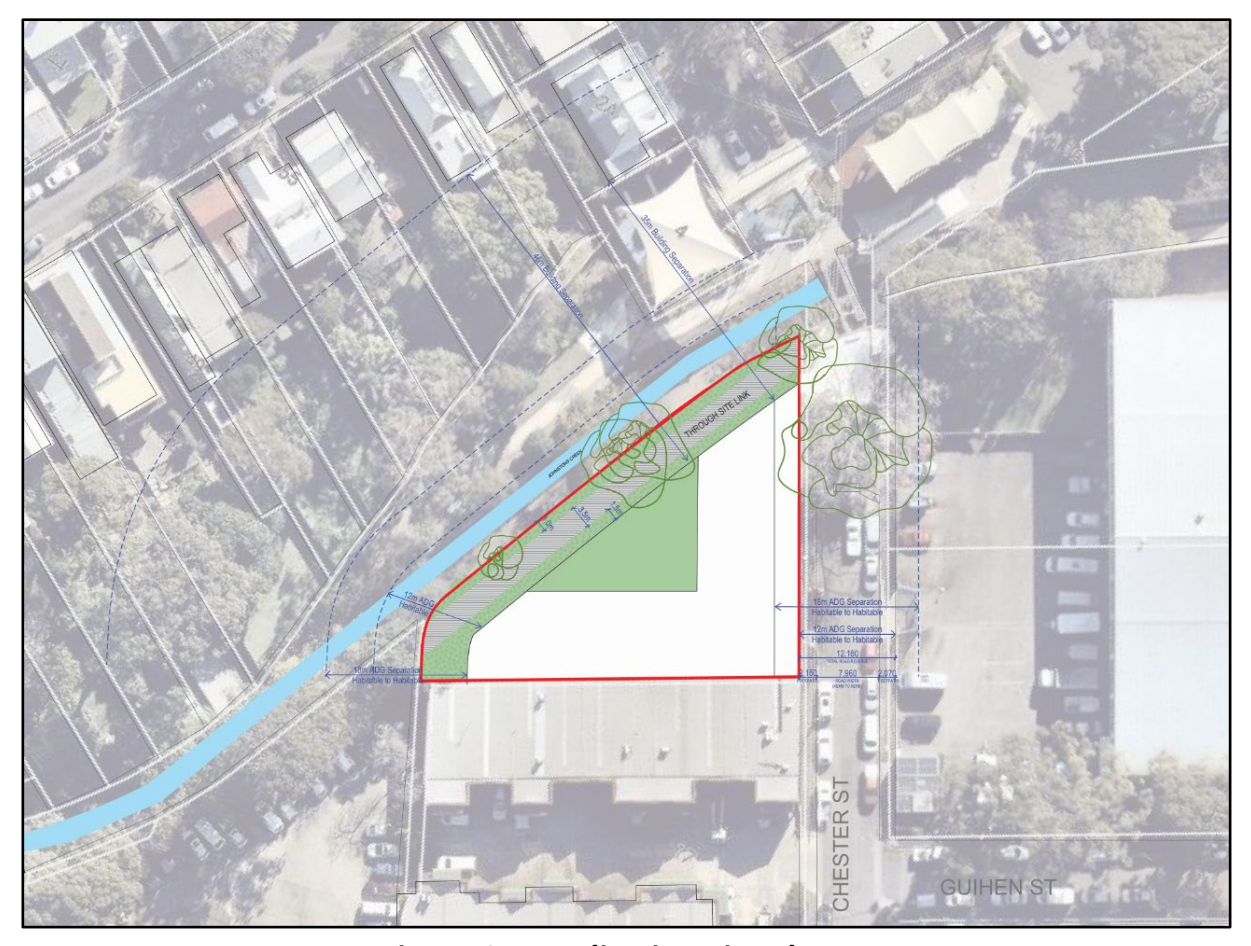
Figure G54: Indicative site plan