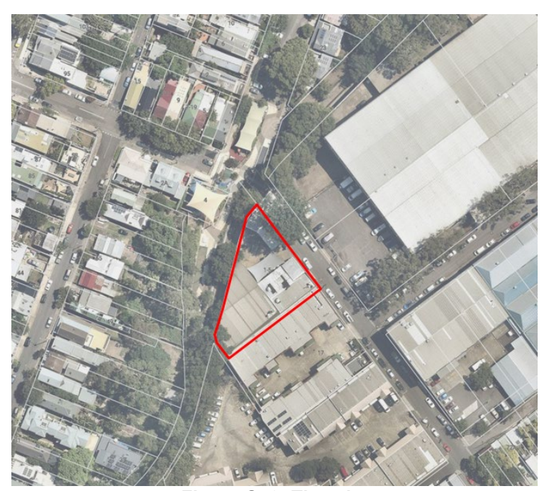
Figure G53: The site