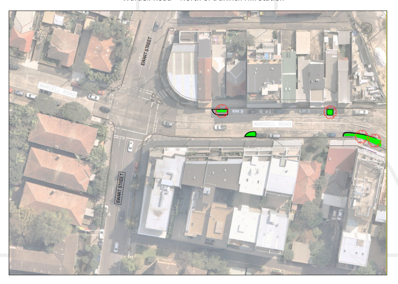
Wardell Road – South of Dulwich Hill Station