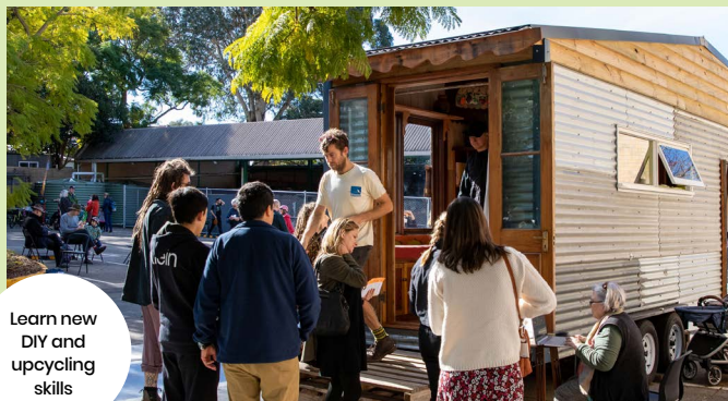
Learn new DIY and upcycling skills

An NGO that empowers women to thrive in work and life. Open for clothes donations on Mondays (10am to 2pm) and Saturdays (9am to 12pm).