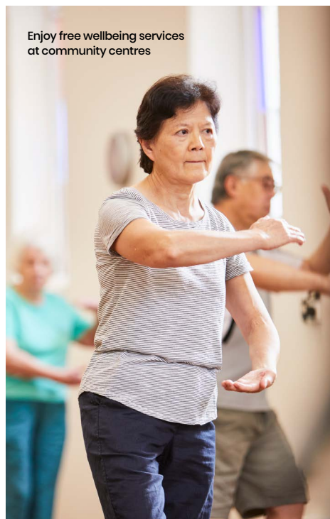
Enjoy free wellbeing services at community centres