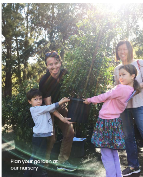
Plan your garden at our nursery