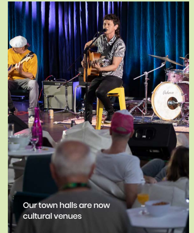
Our town halls are now cultural venues