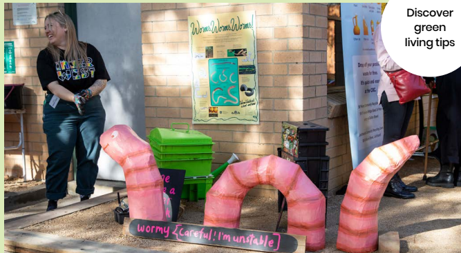
Discover green living tips