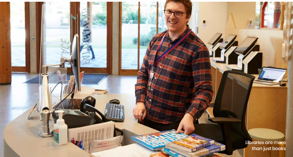
Libraries are more than just books