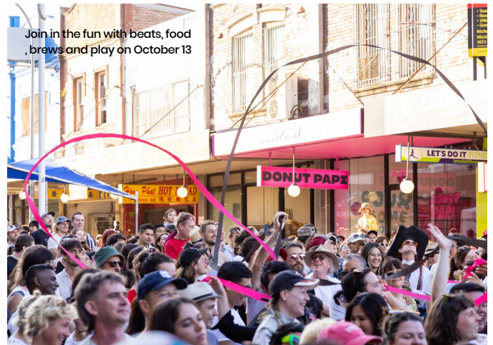
Join in the fun with beats, food, brews and play on October 13