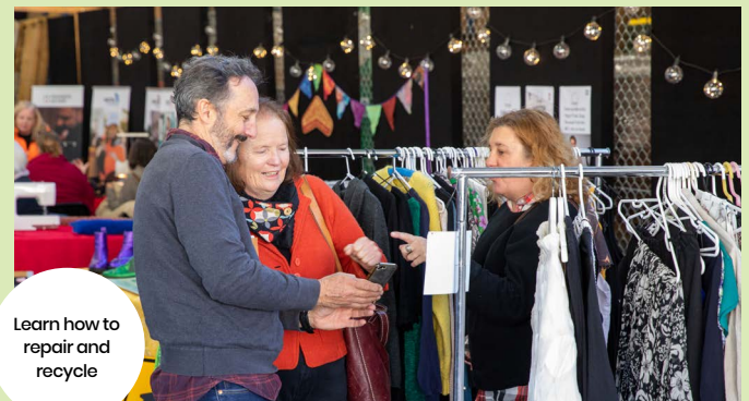
Learn how to repair and recycle

Famous for their DIY and repair workshops, the Bower is open Monday, Tuesday and Friday from 10am to 5pm and the first Saturday of the month 11am to 3pm. The Electrical Repair Shop is open Wednesdays from 2pm to 6:30pm (booking required).