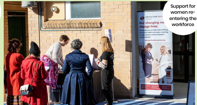
Support for women re-entering the workforce

An initiative of Inner West Council and runs workshops, webinars, events and programs to inspire the community to reduce their environmental impact.