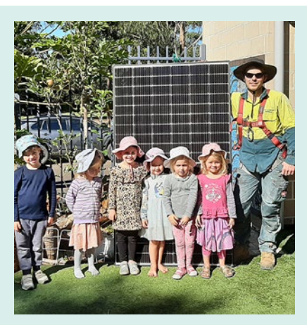
Council's solar rollout completed in in June included replacement and expansion at John McMahon Children's Centre in Birchgrove

Find out more about all the ways Council and the community are going solar at innerwest.nsw.gov.au/Solar