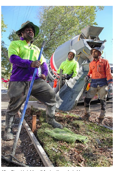
Allen Street Leichhardt footpath works in May

Council has welcomed improved lighting along the popular Bay Run. Council has lobbied the NSW Government for many years to provide lighting in the section of the Iron Cove Bay Run that passes through Callan Park. The new lighting works are now complete, along both Glover Street and King George Park.