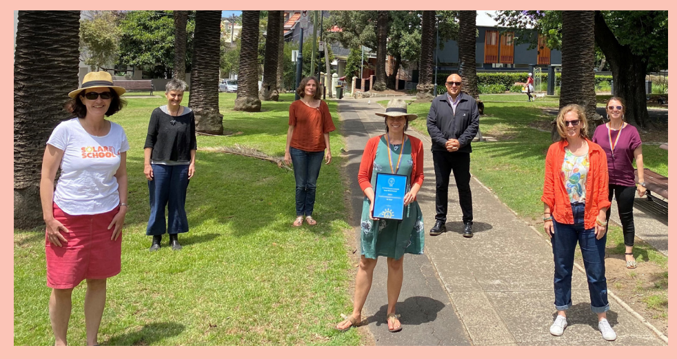
A socially distanced Community Sustainability team with the award