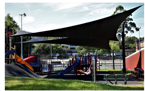
Shade sail at Darrell Jackson Gardens in Summer Hill

More information and opening celebrations will be posted on Council's social media and website as it comes to hand.