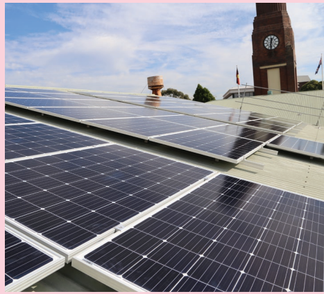
One of Council's latest solar installations is a 15kW solar array on Petersham Town Hall, which combined with an LED upgrade at the site, will save over 15 tonnes of carbon every year. Thirty Council buildings now have solar panels.