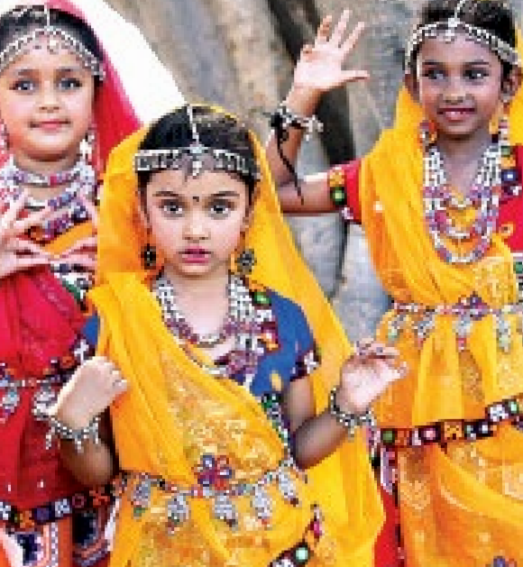
Thousands of enthusiasts braved 40+ degree heat to attend Carnival of Cultures in Ashfield Park