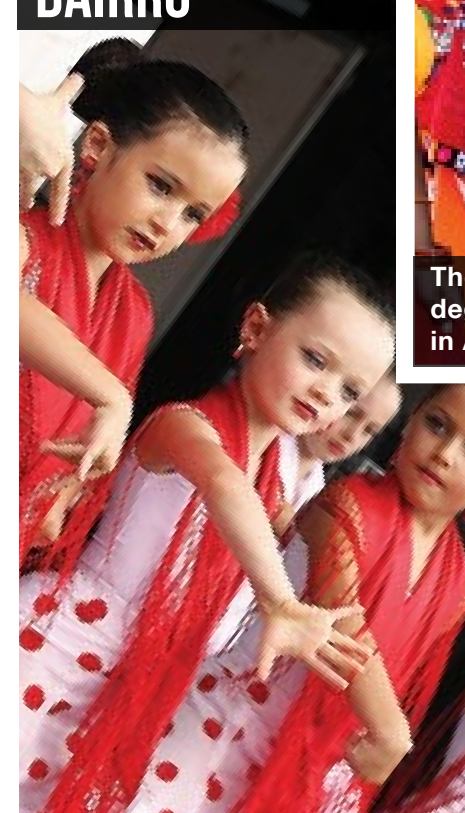
Thirty thousand people packed Audley and Fisher streets in Petersham for the 15th annual Bairro Português Petersham Food & Wine Fair