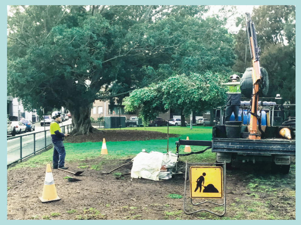
Council will spend nearly $5,000,000 on tree planting this year