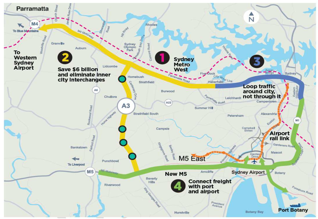
Figure 2.2 The City of Sydney's alternative proposal to the M4 - M5 Link

There are significant similarities between the views expressed by Inner West Council and City of Sydney proposals for a better M4-M5 Link. There could be merit in promoting a joint effort between the Councils to work with SMC and State Government to re-assess these proposals in detail, update the business case and EIS, and deliver a better outcome for the people that will live, work, commute, travel, deliver, cycle, play and walk in this space for many decades to come. We deserve a better Plan for Sydney's Inner West.