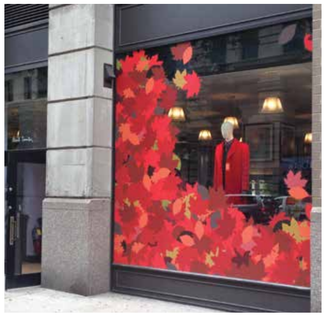
A retailer promotes the seasonal change via their window display.

Create your own retail calendar and select events relevant to your business, and merchandise your product ranges accordingly.