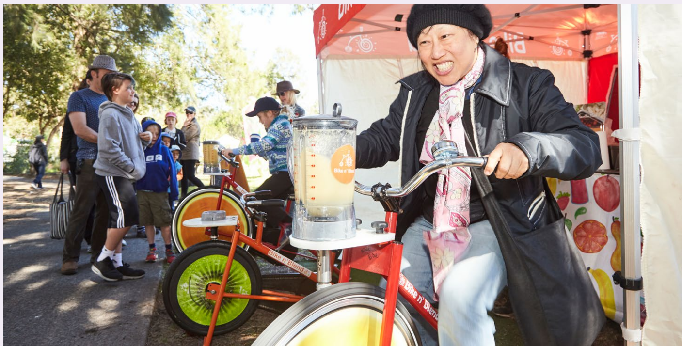
Pictured: Inner West Footprints Ecofestival

Council acknowledges that these projects funded from this annual grant program will be undertaken on the land of the Gadigal Wangal peoples and pays its respects to Elders past, present and emerging.