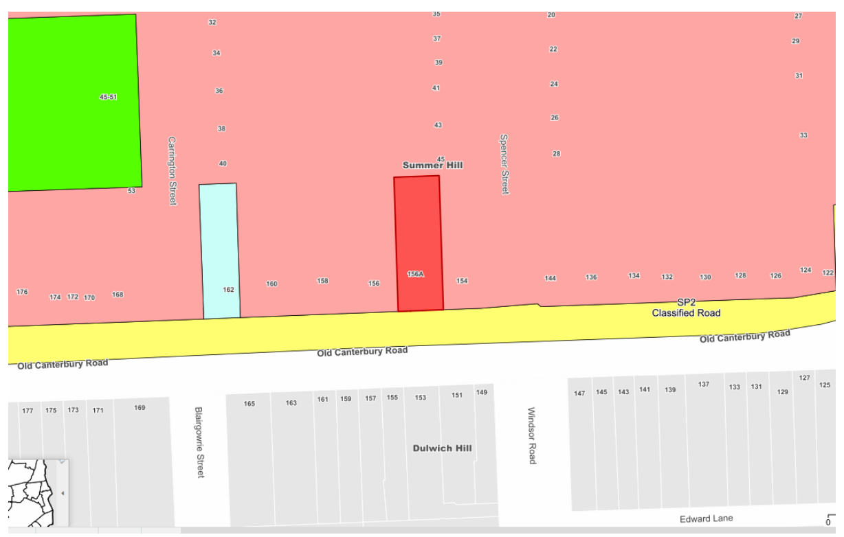
Figure 1 – Zoning Map, subject site identified by red box