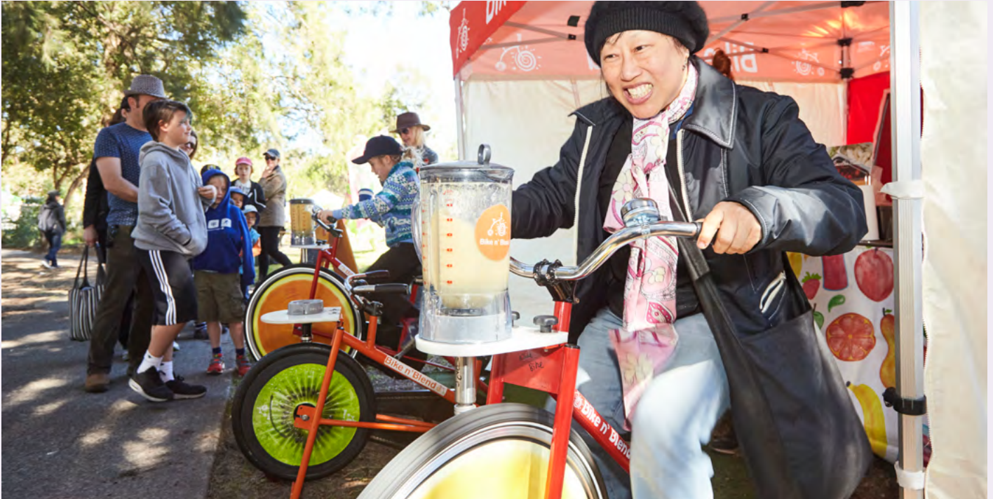
Pictured: Inner West Footprints Ecofestival

Council acknowledges that these projects funded from this annual grant program will be undertaken on the land of the Gadigal Wangal peoples and pays its respects to Elders past, present and emerging.