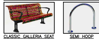
CLASSIC GALLERIA SEAT SEMI HOOP

DEMOLISH EXISTING CONCRETE MEDIAN ISLAND. CONSTRUCT NEW CONCRETE MEDIAN ISLAND (WITH PORPHYRY STONE INFILL) WITH MOUNTABLE KERB PAINTED WITH WHITE REFLECTIVE PAINT.